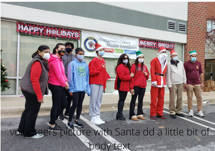
volunteers picture with Santa and a little bit of body text